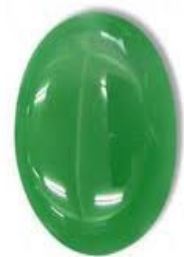
True imperial jadeite of fine green colour.

Jade 玉 (Yu in Chinese pinyin) was defined as beautiful stones by Xu Zhen (about 58 -147AD) in Shuo Wen Jie Zi, the first Chinese dictionary. Jade is generally classified into soft jade (nephrite) and hard jade (jadeite). Since China only had the soft jade until jadeite was imported from Burma during the Qing dynasty (1271-1368), jade traditionally refers to the soft jade so it is also called traditional jade. Jadeite is called Feicui in Chinese. Feicui is now more popular and valuable than the soft jade in China.