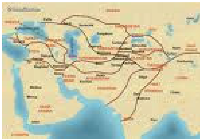
The Silk Road from Chang'an (Xi'an) to the west

Thousands of years have passed since China first discovered silkworms. Nowadays, silk, in some sense, is still some kind of luxury. Some countries are trying some new ways to make silk artificially. Hopefully, they can be successful, but whatever the result, nobody should forget that silk was, still is, and will always be a priceless treasure.