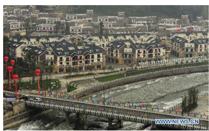
Re-construction of Wenchuan

The Sichuan earthquake has had a number of profound effects on Chinese society. Tens of thousands of volunteers have flocked to the area to help with the relief effort in an unprecedented wave of civic spirit, while the local media have - at times - given an unusually frank portrayal of the destruction and suffering.