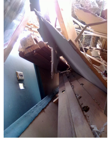
The "A" frame that protected Bruce

I was completely trapped when the roof and debris collapsed on me, and the rest of my body was pinned under the doors, wall, concrete rubble and live wires all exposed, my upper torso had about a one cm to move and my arms had limited movement, but I was able to use my cellphone and call emergency 111 and sent numerous text messages for help to my wife, daughter and son. This was to no avail as the Vodafone network overloaded. In this extremely unusual situation, I had some excruciating pain in my foot – so I applied a tourniquet with my belt below my knee and had very limited mobility. I yelled out "help" continuously and within 10 to 20 minutes George, the building custodian heard me. Later on with the arrival of 2 fire rescuers and several construction men, they pulled me out with their bare hands within an hour.