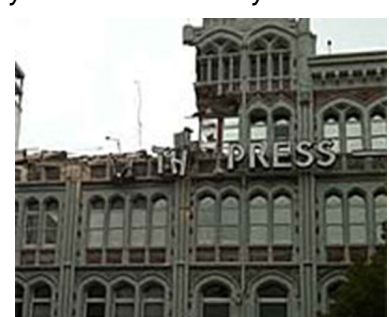
The damaged Press building

alive as mobile phone networks were still down. I was over at the Hospital where an orthopaedic surgeon examined me. My house is OK, except for a few more cracks etc, and we had lost of power for about 7 to 8 hours but had running water. This was absolutely terrifying, so much worse than the Sept 4 earthquake, as it was so very violent and the duration was so short. We now had many after shocks everyday - almost normal for us! My personal stuff is still in the Press building, and it's unknown if any of the staff can ever retrieve our gear at this stage. My car which was parked on the street near the Avon River was covered to the underside up to around